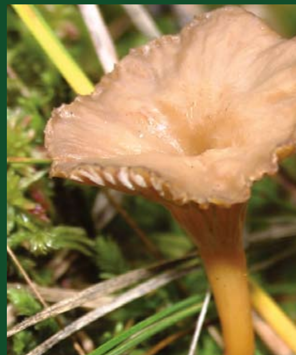
Yellow Foot, Trumpet - Cantharellus tubaeformis