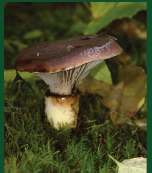
Slimy Gomphidius - Gomphidius glutinosus