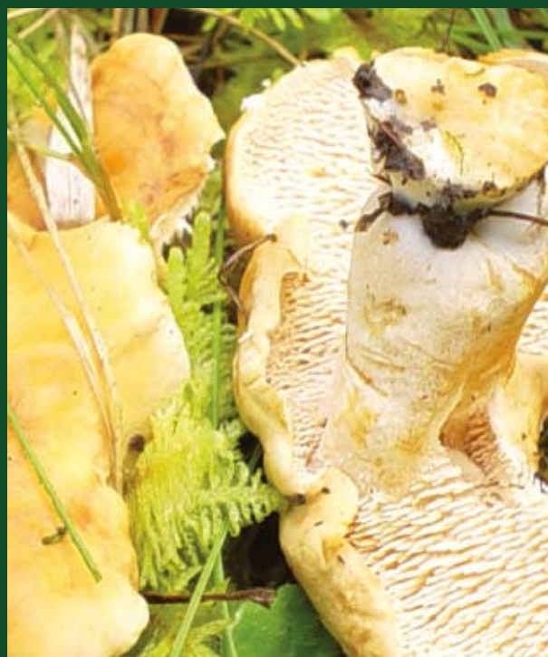
Hedgehog - Hydnum repandum