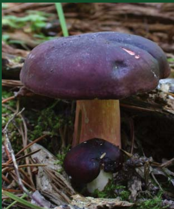
Shrimp Russula - Russula xerampelina