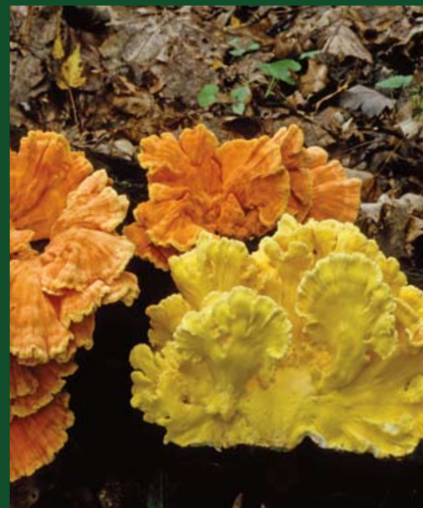
Chicken of the Woods - Laetiporus sulphureus