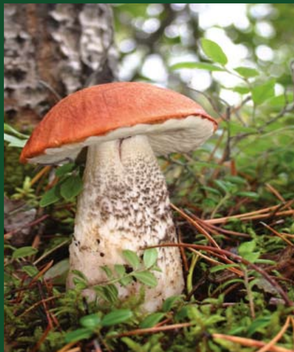
Red Top - Leccinum boreale