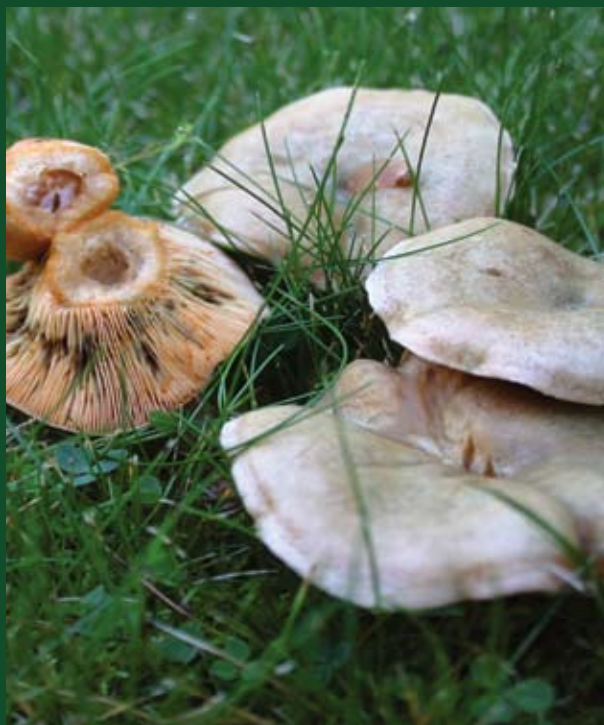
Saffron Milk Cap - Lactarius deliciosus