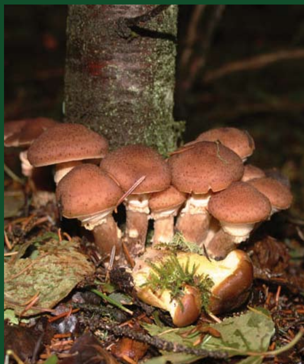
Honey Mushroom - Armillaria ostoyae