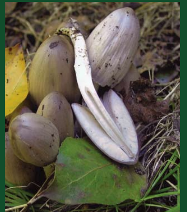
Inky Cap - Coprinopsis atramentaria