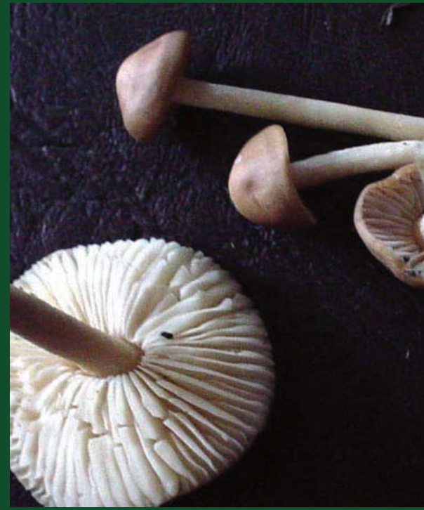
Fairy Ring - Marasmius oreades