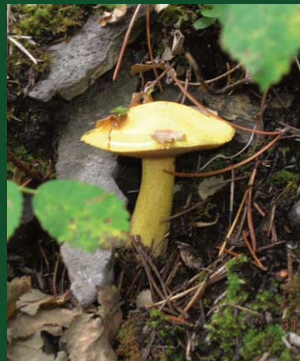
Woolly Pine Bolete - Suillus tomentosus