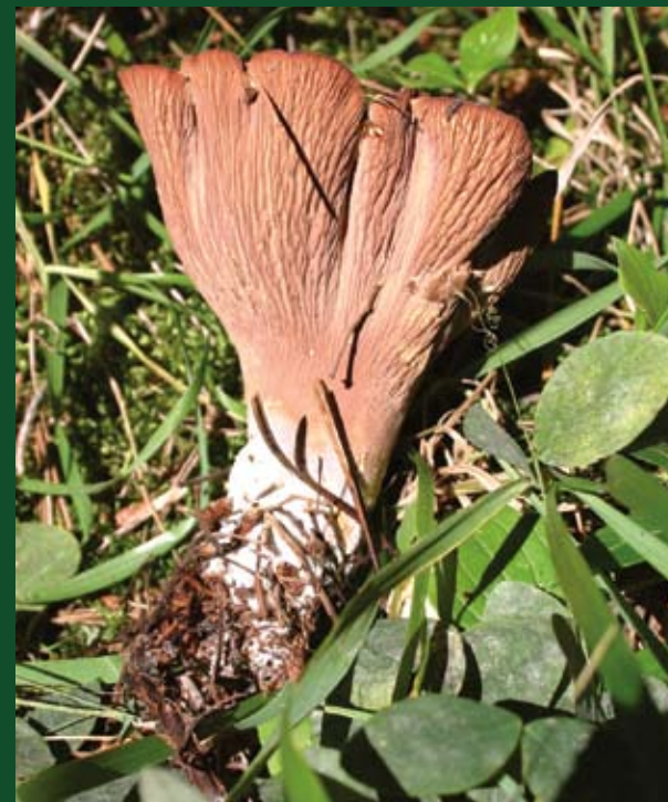
Pigs Ears - Gomphus clavatus