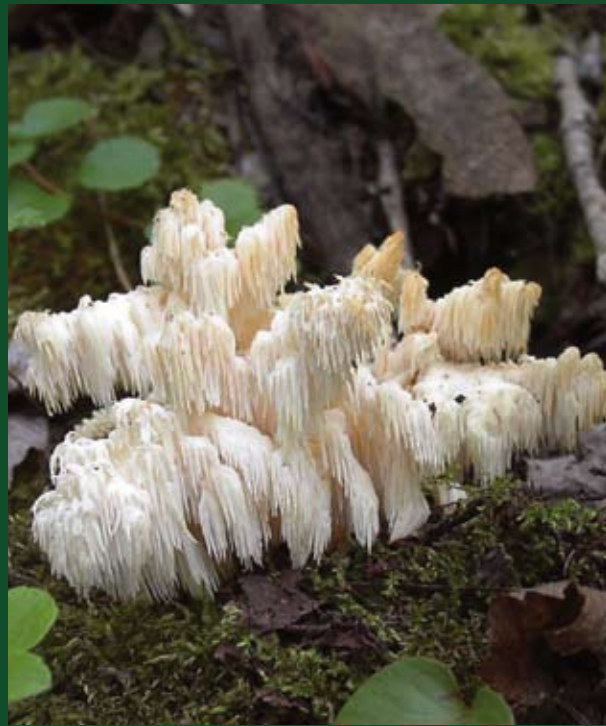
Comb's Tooth - Hericium coralloides