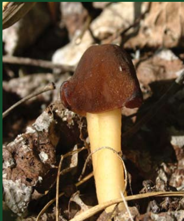
Early Morel - Verpa conica var. conica