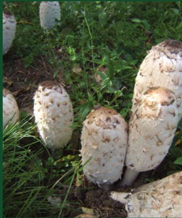
Shaggy Mane - Coprinus comatus