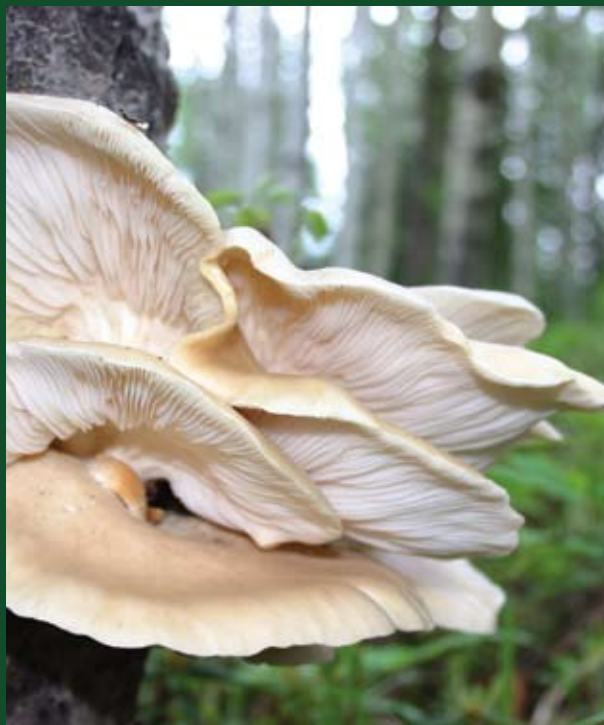
Oyster Mushroom - Pleurotus ostreatus