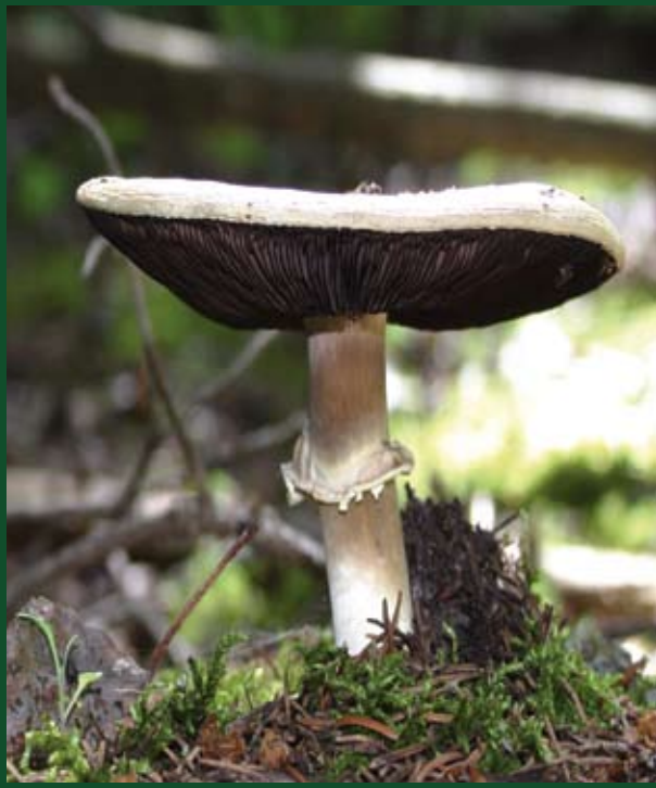
Field Mushroom - Agaricus silvaticus