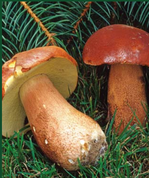
King Bolete - Boletus edulis