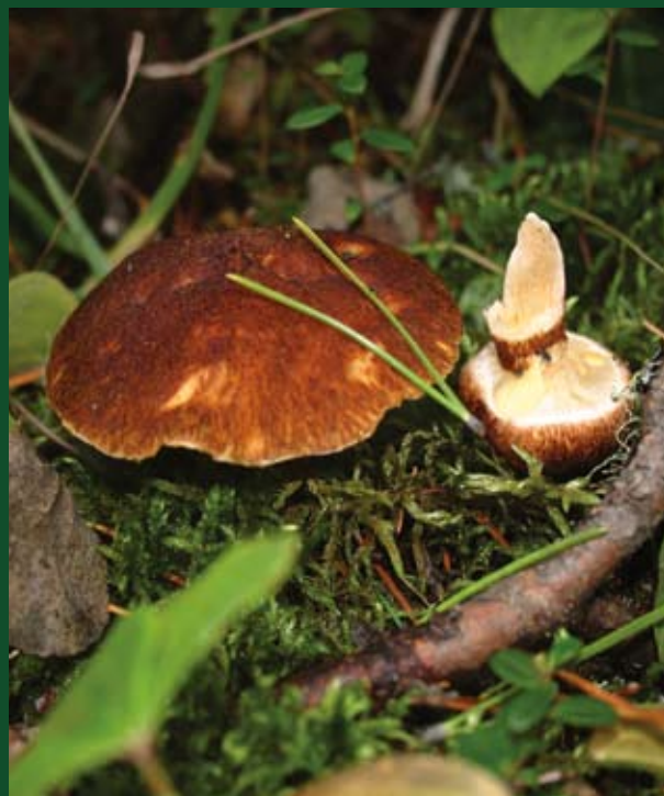
Hollowfoot - Suillus cavipes