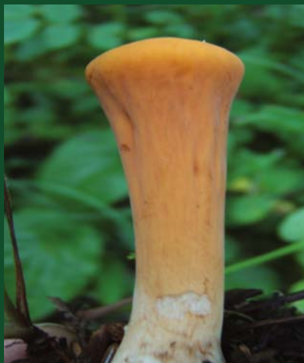
Club Mushroom - Clavariadelphus truncatus