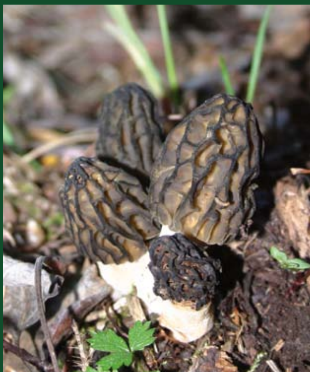
Morel - Morchella elata