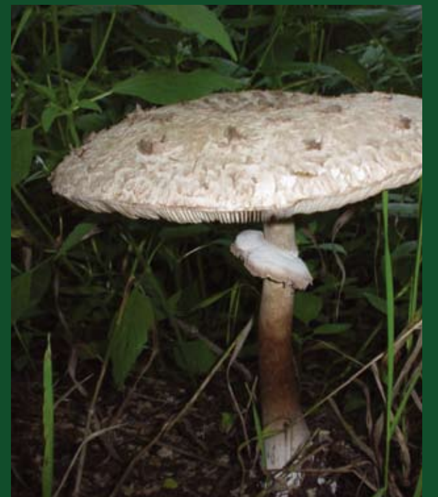
Shaggy Parasol - Chlorophyllum rhacodes