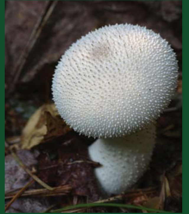
Puffball - Lycoperdon perlatum