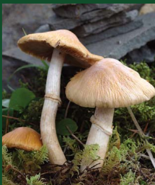
Gypsy - Rozites caperatus